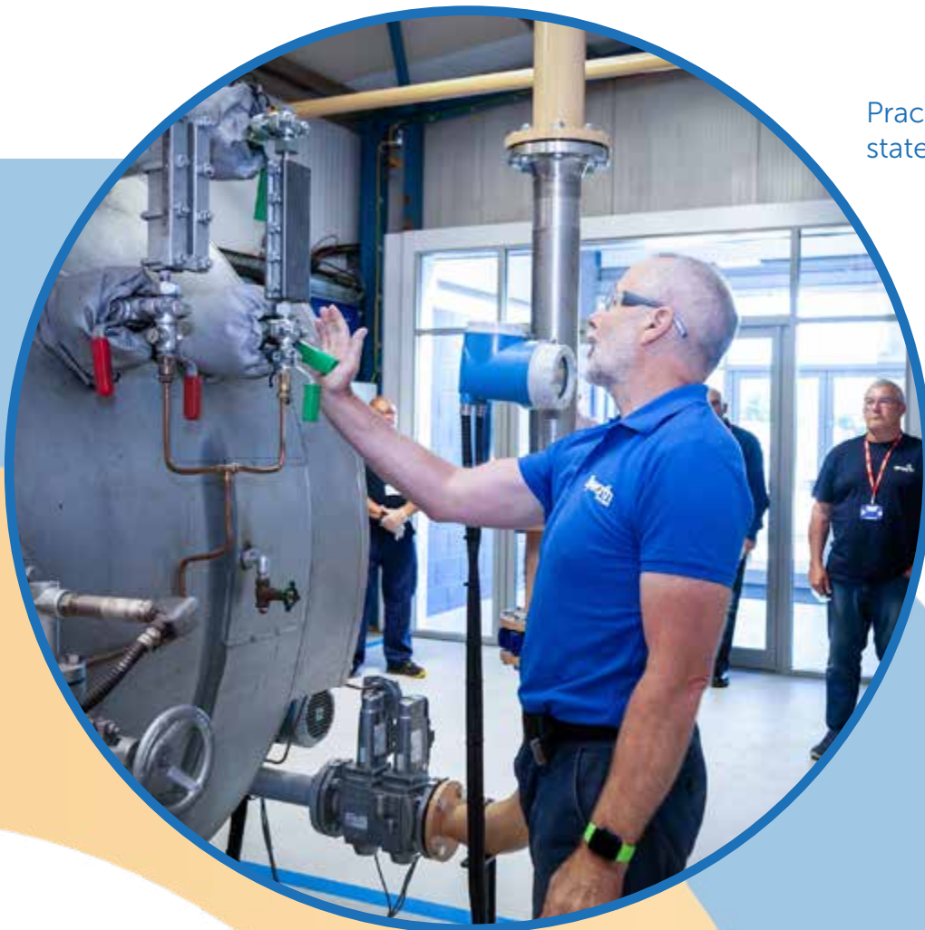
Practical training in our state of the art boiler house.

The Fundamentals course is intended to give an introduction to persons who have limited experience of boiler operation focusing on best practice for maintaining a more efficient plant.